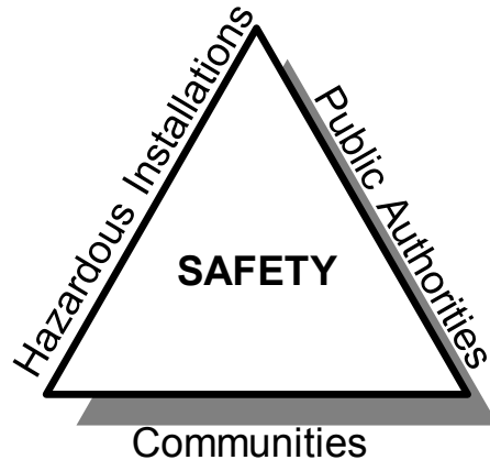
Graphic 1 Safety Partner Triangle

The Canadian Chemical Producers Association (CCPA), who had developed a unique "ethic" for the safe and environmentally sound management of chemicals in the late 1970's, before Bhopal, launched the Responsible Care® initiative in 1985. Responsible Care® is a real Canadian success story. In fact, Responsible Care® is the world's leading voluntary industry initiative - it is run in 53 countries whose combined chemical industries account for nearly 90% of global chemicals production. 11